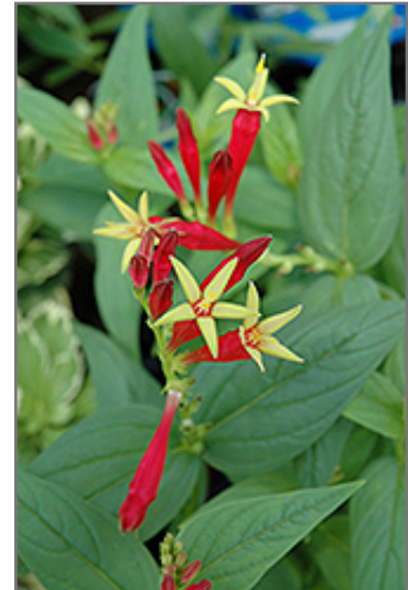
Indian Pink flowers

Indian Pink is recommended for the following landscape applications;