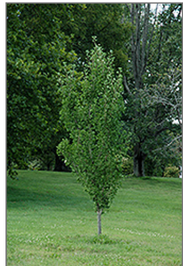
Presidential Gold Ginkgo