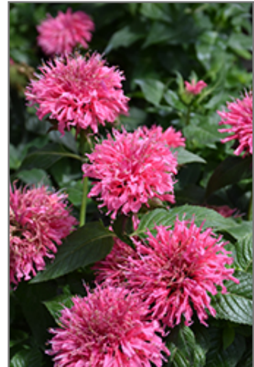
Bubblegum Blast Beebalm flowers