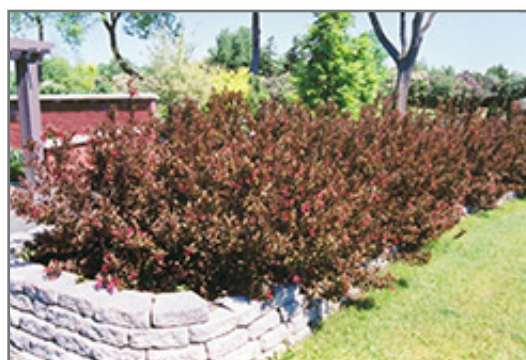
Wine and Roses Weigela