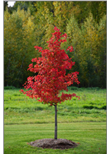
Wildfire Black Gum in fall