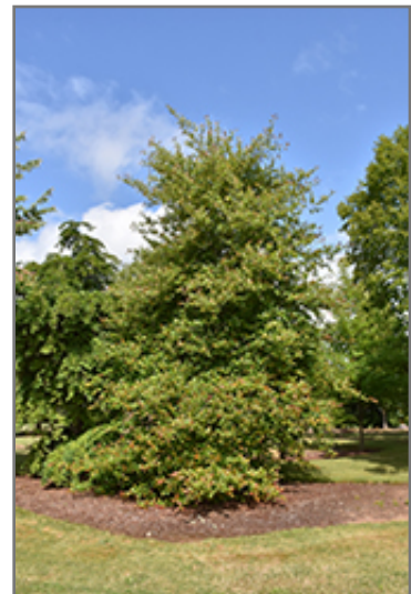
Wildfire Black Gum