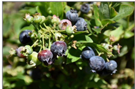
Jelly Bean Blueberry fruit