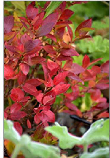
Jelly Bean Blueberry in fall

Jelly Bean Blueberry features dainty clusters of white bell-shaped flowers with shell pink overtones hanging below the branches in mid spring. It has red-variegated green foliage. The glossy oval leaves turn an outstanding red in the fall. It features an abundance of magnificent blue berries in mid summer.