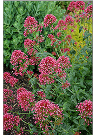
Red Valerian flowers

Red Valerian is recommended for the following landscape applications;