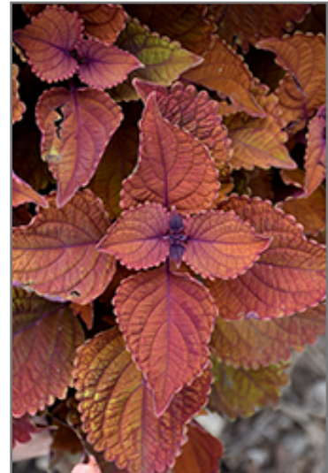
Wall Street Coleus foliage