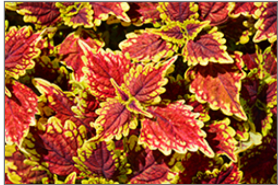
Oxford Street Coleus foliage