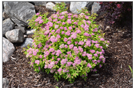
Dakota Goldcharm Spirea in bloom