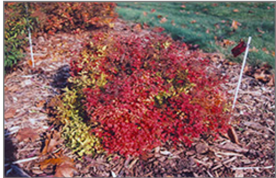
Dakota Goldcharm Spirea in fall

* This is a 'special order' plant - contact store for details