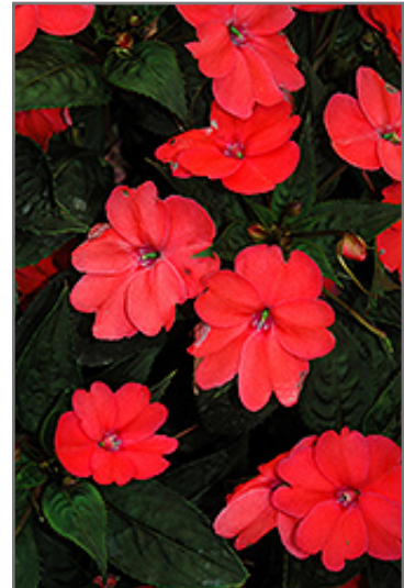
SunPatiens Compact Coral New Guinea Impatiens flowers

SunPatiens Compact Coral New Guinea Impatiens is recommended for the following landscape applications;