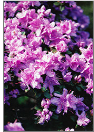
Ramapo Rhododendron flowers