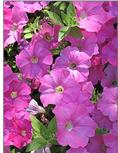
Easy Wave Pink Petunia flowers

This plant will require occasional maintenance and upkeep. Trim off the flower heads after they fade and die to encourage more blooms late into the season. It is a good choice for attracting hummingbirds to your yard, but is not particularly attractive to deer who tend to leave it alone in favor of tastier treats. It has no significant negative characteristics.