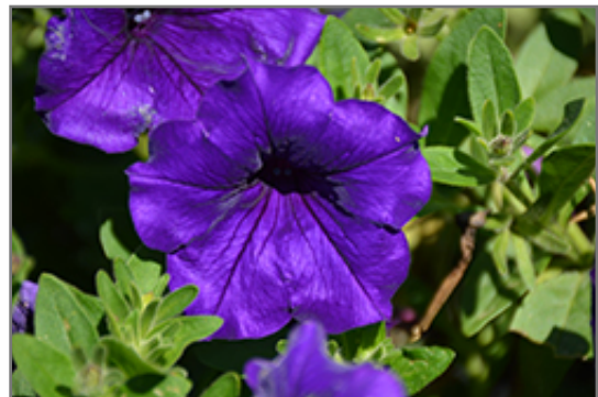
Easy Wave Blue Petunia flowers