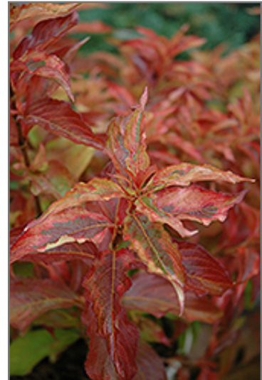
My Monet Sunset Weigela in fall

My Monet Sunset Weigela makes a fine choice for the outdoor landscape, but it is also well-suited for use in outdoor pots and containers. It is often used as a 'filler' in the 'spiller-thriller-filler' container combination, providing a mass of flowers and foliage against which the thriller plants stand out. Note that when grown in a container, it may not perform exactly as indicated on the tag - this is to be expected. Also note that when growing plants in outdoor containers and baskets, they may require more frequent waterings than they would in the yard or garden.