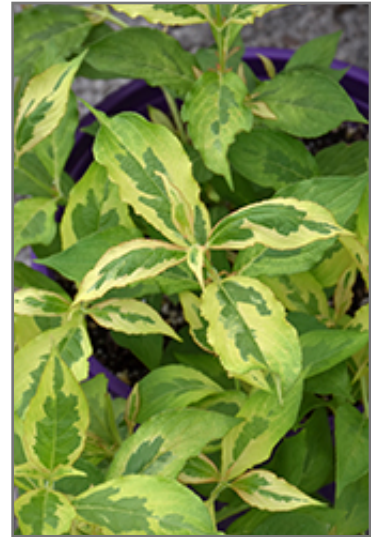
My Monet Sunset Weigela foliage

My Monet Sunset Weigela is recommended for the following landscape applications;