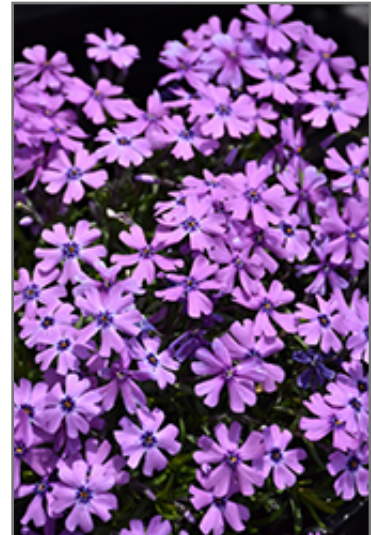
Purple Beauty Moss Phlox flowers