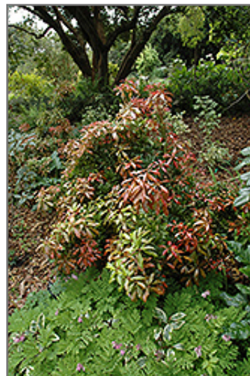
Mountain Fire Japanese Pieris

This shrub does best in full sun to partial shade. It requires an evenly moist well-drained soil for optimal growth, but will die in standing water. It is very fussy about its soil conditions and must have rich, acidic soils to ensure success, and is subject to chlorosis (yellowing) of the foliage in alkaline soils. It is somewhat tolerant of urban pollution, and will benefit from being planted in a relatively sheltered location. Consider applying a thick mulch around the root zone in winter to protect it in exposed locations or colder microclimates. This is a selected variety of a species not originally from North America, and parts of it are known to be toxic to humans and animals, so care should be exercised in planting it around children and pets.