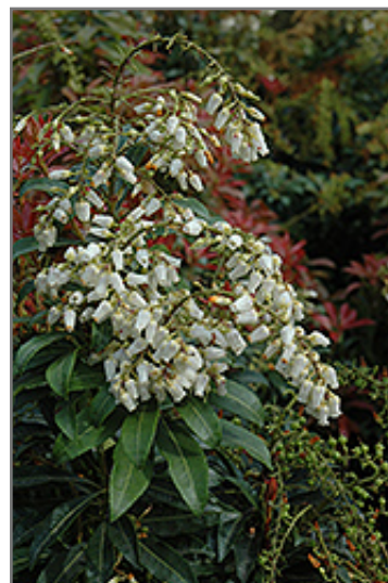
Mountain Fire Japanese Pieris flowers