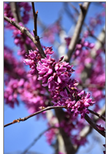
Eastern Redbud (tree form) flowers