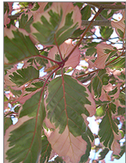
Tricolor Beech foliage