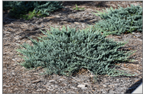
Blue Chip Juniper