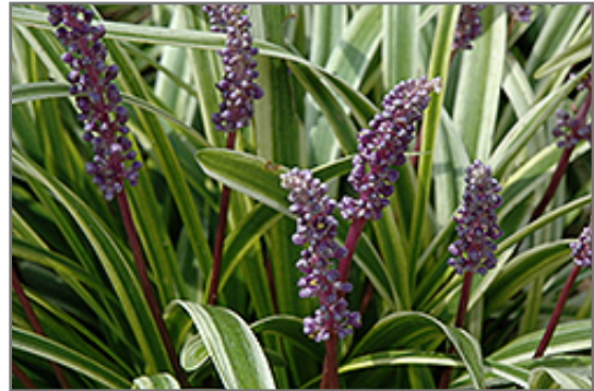
Variegata Lily Turf flowers

Variegata Lily Turf is recommended for the following landscape applications;