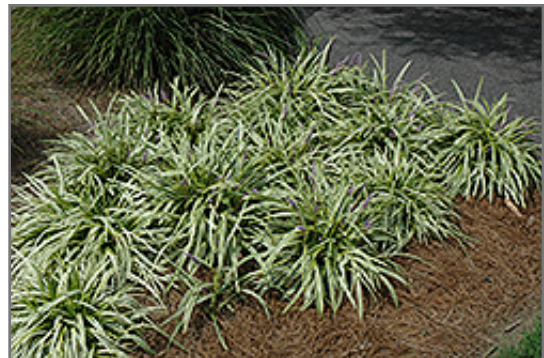
Variegata Lily Turf in bloom