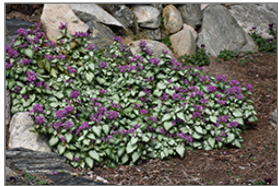
Purple Dragon Spotted Dead Nettle in bloom