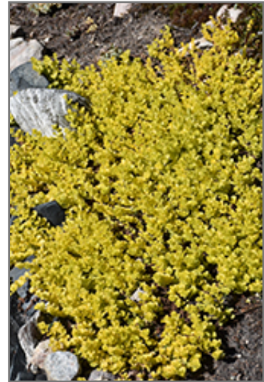
Goldilocks Creeping Jenny

Goldilocks Creeping Jenny will grow to be only 6 inches tall at maturity, with a spread of 3 feet. When grown in masses or used as a bedding plant, individual plants should be spaced approximately 24 inches apart. Its foliage tends to remain low and dense right to the ground. It grows at a fast rate, and under ideal conditions can be expected to live for approximately 10 years. As an herbaceous perennial, this plant will usually die back to the crown each winter, and will regrow from the base each spring. Be careful not to disturb the crown in late winter when it may not be readily seen!