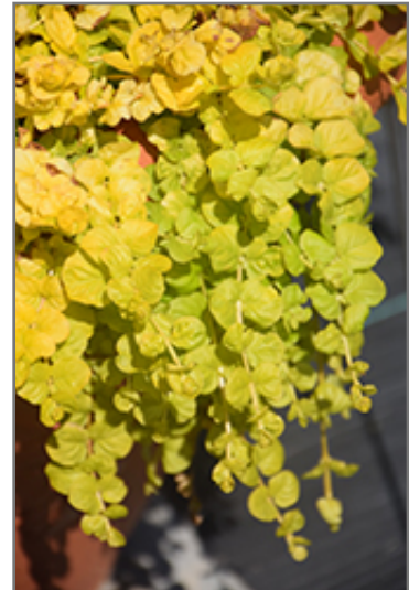
Goldilocks Creeping Jenny foliage