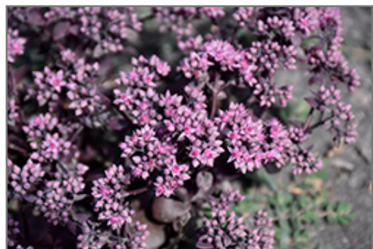
Red Carpet Stonecrop flowers