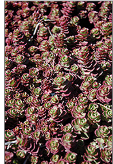
Red Carpet Stonecrop foliage

This plant will require occasional maintenance and upkeep, and is best cleaned up in early spring before it resumes active growth for the season. Deer don't particularly care for this plant and will usually leave it alone in favor of tastier treats. Gardeners should be aware of the following characteristic(s) that may warrant special consideration;