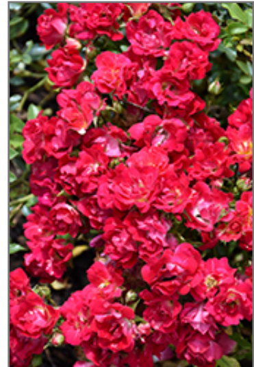
Red Drift Rose flowers

Red Drift Rose is recommended for the following landscape applications;