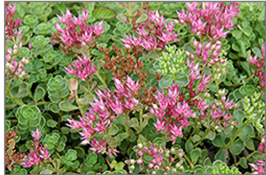
John Creech Stonecrop flowers

John Creech Stonecrop is recommended for the following landscape applications;