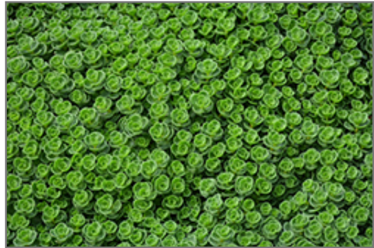
John Creech Stonecrop foliage

John Creech Stonecrop is a fine choice for the garden, but it is also a good selection for planting in outdoor pots and containers. Because of its spreading habit of growth, it is ideally suited for use as a 'spiller' in the 'spiller-thriller-filler' container combination; plant it near the edges where it can spill gracefully over the pot. Note that when growing plants in outdoor containers and baskets, they may require more frequent waterings than they would in the yard or garden.