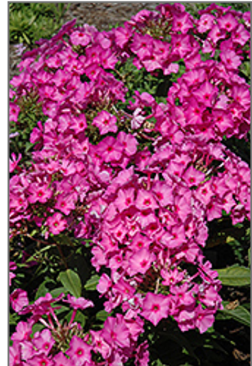
Flame Pink Garden Phlox flowers