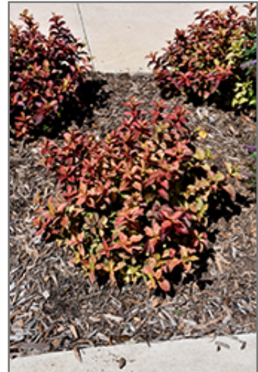
Midnight Sun Reblooming Weigela