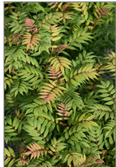
Mr. Mustard False Spirea foliage