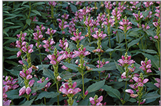
Pink Turtlehead flowers

Pink Turtlehead is recommended for the following landscape applications;