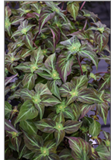
Night Light Moneywort foliage