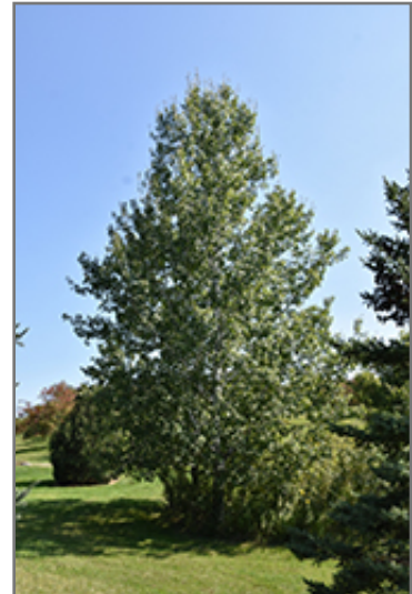
Trembling Aspen

Trembling Aspen is recommended for the following landscape applications;