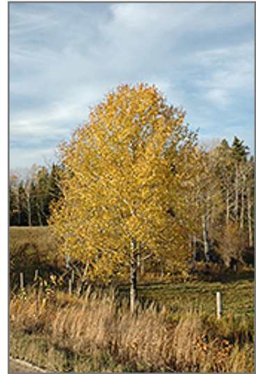
Trembling Aspen in fall

This tree should only be grown in full sunlight. It is an amazingly adaptable plant, tolerating both dry conditions and even some standing water. It is considered to be drought-tolerant, and thus makes an ideal choice for xeriscaping or the moisture-conserving landscape. It is not particular as to soil type or pH. It is quite intolerant of urban pollution, therefore inner city or urban streetside plantings are best avoided. This species is native to parts of North America.