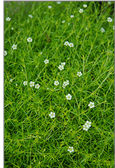
Scotch Moss flowers

Scotch Moss will grow to be only 1 inch tall at maturity, with a spread of 12 inches. Its foliage tends to remain low and dense right to the ground. It grows at a medium rate, and under ideal conditions can be expected to live for approximately 10 years. As an evergreen perennial, this plant will typically keep its form and foliage year-round.