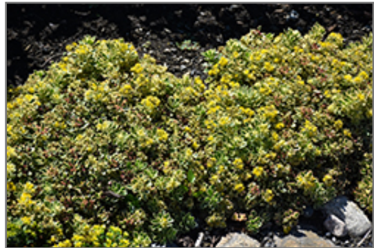
Rock 'N Low Boogie Woogie Stonecrop in bloom