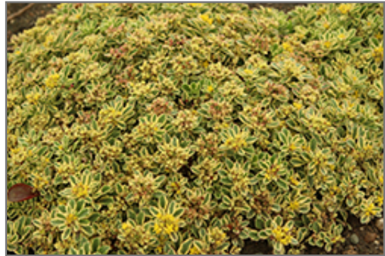
Rock 'N Low Boogie Woogie Stonecrop flowers

Rock 'N Low Boogie Woogie Stonecrop is a dense herbaceous perennial with a mounded form. Its medium texture blends into the garden, but can always be balanced by a couple of finer or coarser plants for an effective composition.