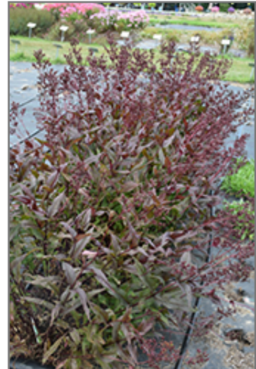
Pocahontas Beard Tongue

This is a relatively low maintenance plant, and is best cleaned up in early spring before it resumes active growth for the season. It is a good choice for attracting butterflies to your yard. It has no significant negative characteristics.