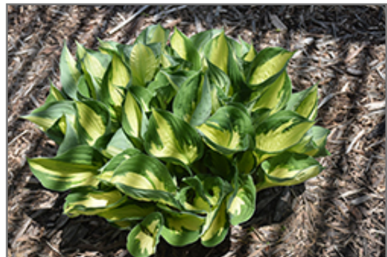
Morning Light Hosta