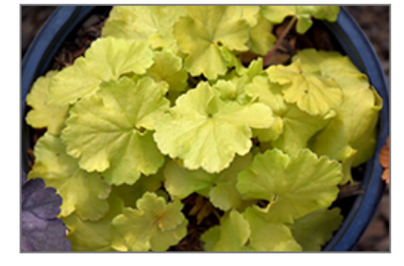
Northern Exposure Lime Coral Bells foliage

Northern Exposure Lime Coral Bells is recommended for the following landscape applications;