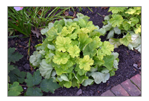
Northern Exposure Lime Coral Bells