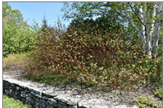
Bailey's Red Twig Dogwood in spring