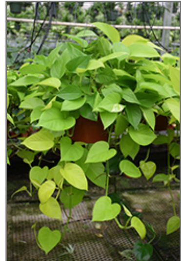
Neon Pothos in full

When grown indoors, Neon Pothos can be expected to grow to be about 5 feet tall at maturity, with a spread of 24 inches. It grows at a fast rate, and under ideal conditions can be expected to live for approximately 10 years. This houseplant performs well in both bright or indirect sunlight and strong artificial light, and can therefore be situated in almost any well-lit room or location. It does best in average to evenly moist soil, but will not tolerate standing water. The surface of the soil shouldn't be allowed to dry out completely, and so you should expect to water this plant once and possibly even twice each week. Be aware that your particular watering schedule may vary depending on its location in the room, the pot size, plant size and other conditions; if in doubt, ask one of our experts in the store for advice. It is not particular as to soil type or pH; an average potting soil should work just fine. Be warned that parts of this plant are known to be toxic to humans and animals, so special care should be exercised if growing it around children and pets.