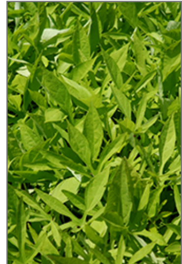
SolarPower Lime Sweet Potato Vine foliage