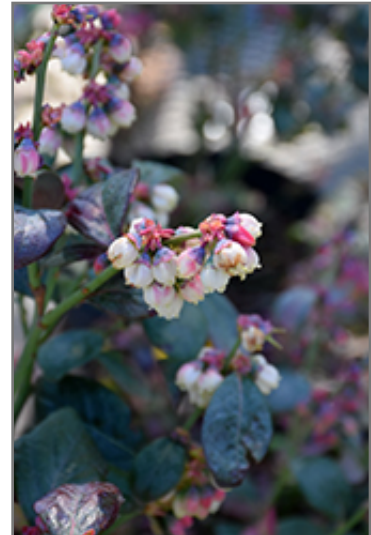
Pink Icing Blueberry flowers

Pink Icing Blueberry will grow to be about 4 feet tall at maturity, with a spread of 4 feet. It has a low canopy. It grows at a fast rate, and under ideal conditions can be expected to live for approximately 20 years. While it is considered to be somewhat self-pollinating, it tends to set heavier quantities of fruit with a different variety of the same species growing nearby.