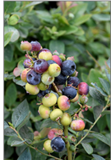
Pink Icing Blueberry fruit

Pink Icing Blueberry features dainty clusters of white bell-shaped flowers with shell pink overtones hanging below the branches in mid spring, which emerge from distinctive pink flower buds. It has bluish-green deciduous foliage which emerges pink in spring. The glossy oval leaves turn an outstanding aqua bluish-green in the fall. It features an abundance of magnificent blue berries in mid summer.