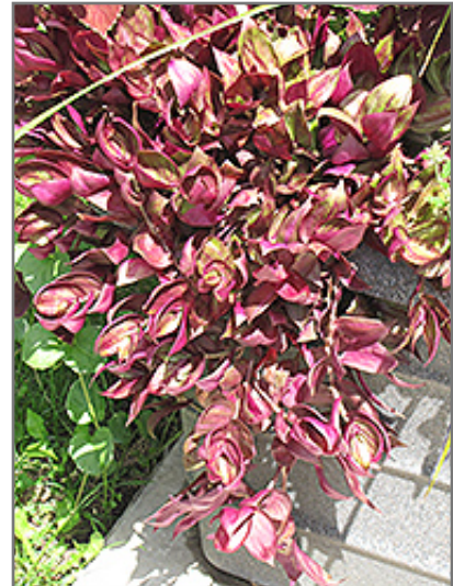
Purple Wandering Jew

Purple Wandering Jew is recommended for the following landscape applications;