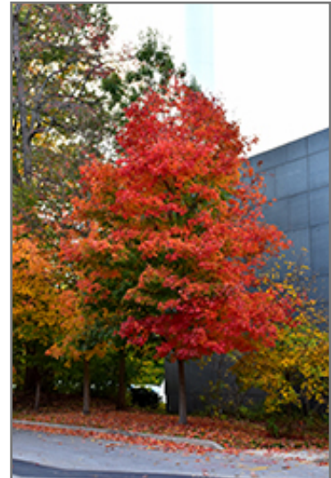
Fall Fiesta Sugar Maple in fall