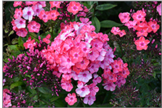
Garden Girls Glamour Girl Garden Phlox flowers

Garden Girls Glamour Girl Garden Phlox is recommended for the following landscape applications;