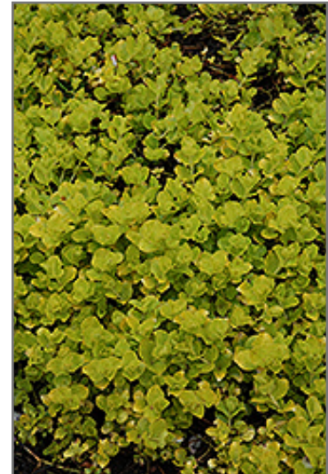
Golden Creeping Jenny foliage

Golden Creeping Jenny is recommended for the following landscape applications;