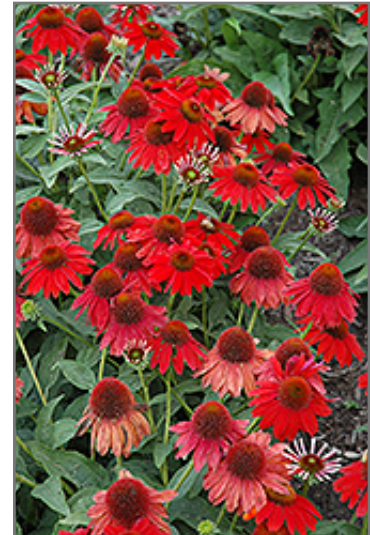
Sombrero Salsa Red Coneflower flowers

Sombrero Salsa Red Coneflower is recommended for the following landscape applications;