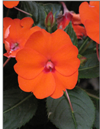
SunPatiens Compact Electric Orange New Guinea Impatiens flowers

This plant will require occasional maintenance and upkeep, and should not require much pruning, except when necessary, such as to remove dieback. It is a good choice for attracting bees and butterflies to your yard. It has no significant negative characteristics.