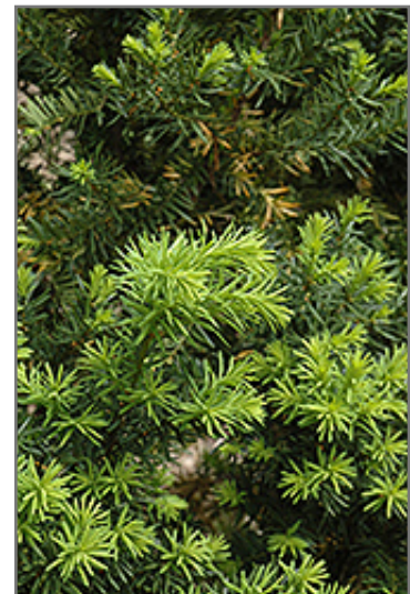
Hicks Yew foliage