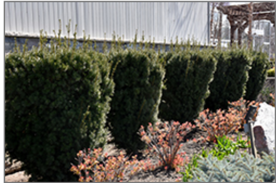
Hicks Yew

This shrub performs well in both full sun and full shade. However, you may want to keep it away from hot, dry locations that receive direct afternoon sun or which get reflected sunlight, such as against the south side of a white wall. It does best in average to evenly moist conditions, but will not tolerate standing water. It is not particular as to soil type or pH. It is highly tolerant of urban pollution and will even thrive in inner city environments, and will benefit from being planted in a relatively sheltered location. Consider applying a thick mulch around the root zone in winter to protect it in exposed locations or colder microclimates. This particular variety is an interspecific hybrid, and parts of it are known to be toxic to humans and animals, so care should be exercised in planting it around children and pets.