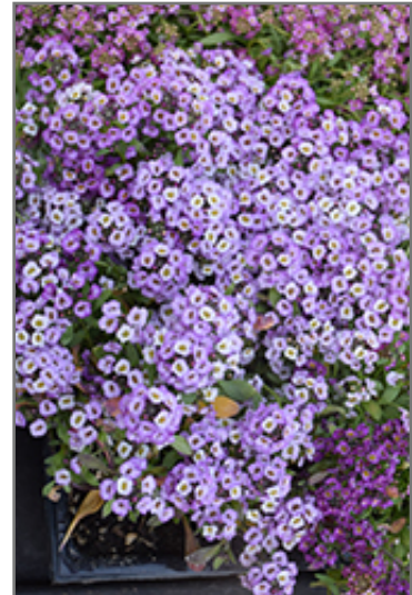
Clear Crystal Lavender Shades Sweet Alyssum flowers

Clear Crystal Lavender Shades Sweet Alyssum is recommended for the following landscape applications;