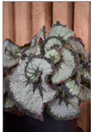
Escargot Begonia foliage